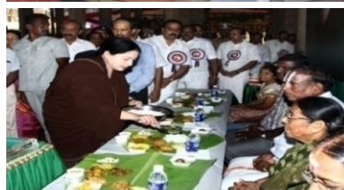
അതിഥി വരുന്ന പ്രദേശത്തിൽ നിന്നും വരുന്നവരുടെ ചെലവ് മൂല്യം ഉൾപ്പെടെ എല്ലാ ചെലവുകളും സംസ്ഥാന സർക്കാർ വഹിച്ചു. 1006 ദാമ്പത്യം കെട്ടിപ്പിടിച്ചു.