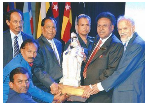
International Tamil Conference- Malaysia-2015