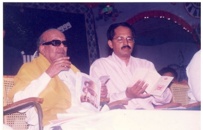
With Hon'ble Chief Minister, Dr Kalaingar Karunanidhi