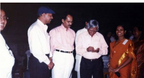
With former President, Dr APJ Abdul Kalam