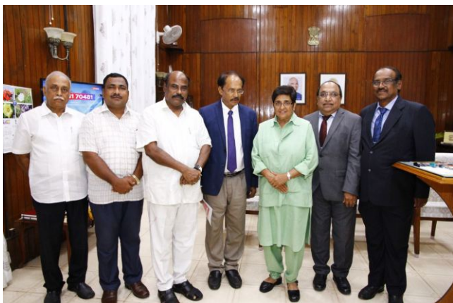
With Hon'ble Lt Governor Puducherry, Tmt Kiran Bedi