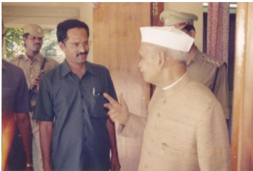
With former President Sankar Dayal Sharma