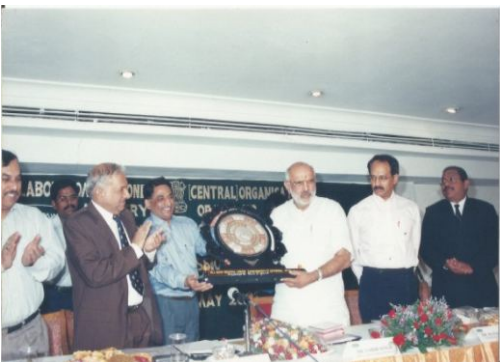
Central Labour Minister Sahib Singh Varma