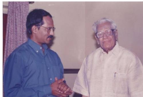
With former President R Venkatraman