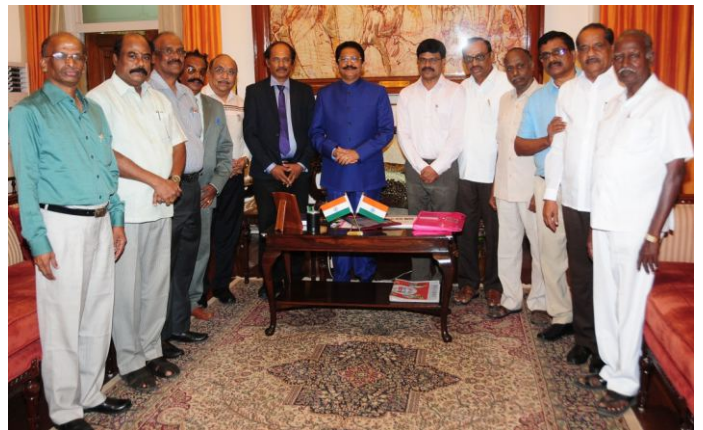
With Hon'ble Governor, CH Vidya Sagar Rao