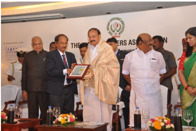
110th Convention of IOA