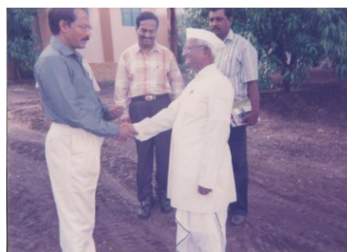
With Mr Anna Hazare