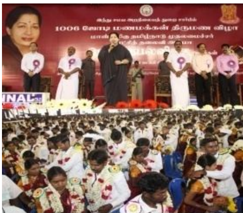
അതിഥി വരുന്ന പ്രദേശത്തിൽ നിന്നും വരുന്നവരുടെ ചെലവ് മൂല്യം ഉൾപ്പെടെ എല്ലാ ചെലവുകളും സംസ്ഥാന സർക്കാർ വഹിച്ചു. 1006 ദാമ്പത്യം കെട്ടിപ്പിടിച്ചു.